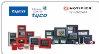
Fire Detection System