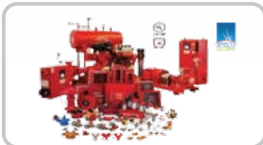
Fire Protection System