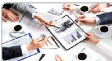
Design & Consultancy